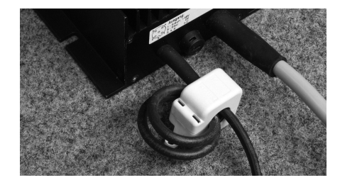
Fig. 2: Ferrite mounted on the secondary cable of the device

A ferrite, incorporated into the secondary cable, is included in the delivery.