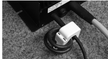
Fig. 2: Ferrite mounted on the secondary cable of the device

A ferrite, incorporated into the secondary cable, is included in the delivery.